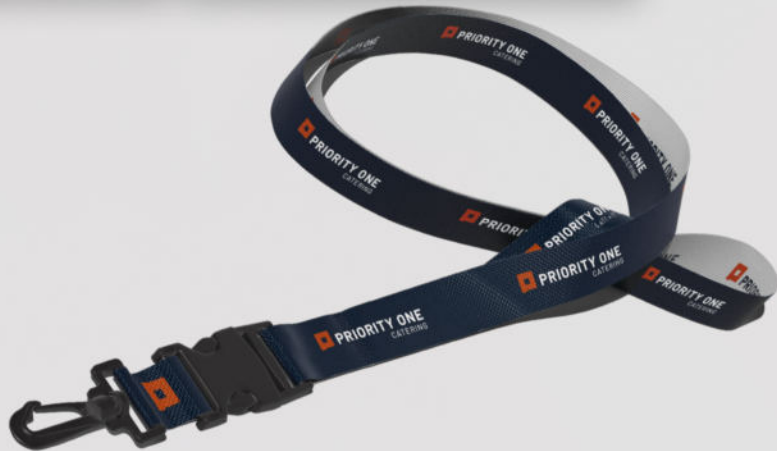
ID Card Badge